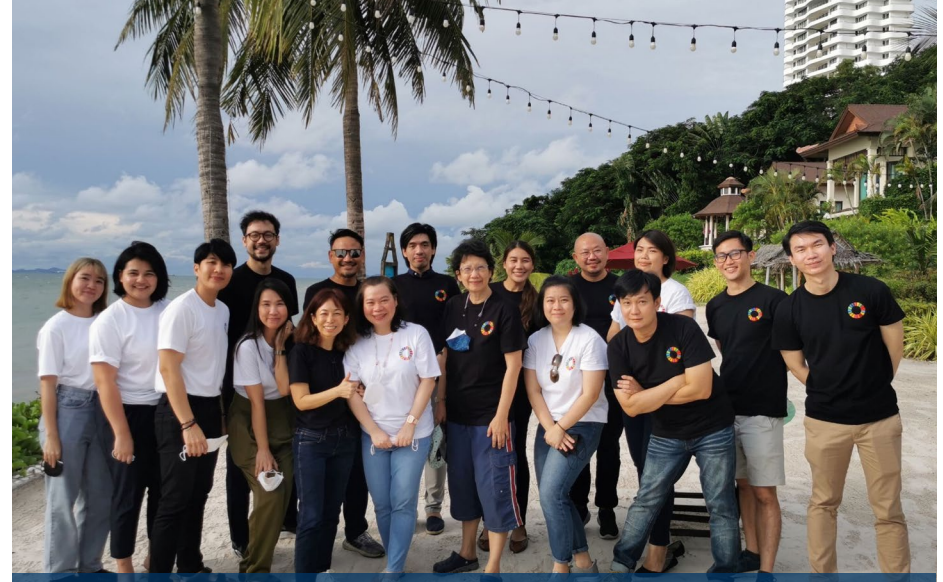
ERM team from Thailand participating in Global Goals Week (GGW). ERM employees around the world participate annually in this day of action, to mark the anniversary of the adoption of the Sustainable Development Goals (SDGs).

"I love being part of the ERM Foundation team in Brazil, particularly through the work I am doing with IDESAM to protect the Amazon rainforest, and support sustainable livelihoods for local communities. It's a really important and fulfilling part of my role at ERM."