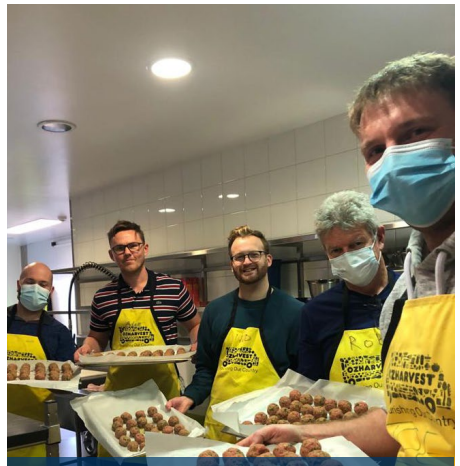
ERM employees in Australia have a longstanding relationship with Oz Harvest – Australia's leading food rescue organisation. The team delivers surplus food to charities, that would otherwise end up in landfill – helping to feed people in need. ERM volunteers provide active volunteer support for this important work.

"Through the ERM Foundation, we are building a partnership with a water education and training non-profit that supports Indigenous communities in Canada. Our colleagues have generously and continuously committed time, energy and funds to support this work, underscoring the immeasurable power of our ERM community and shared values."